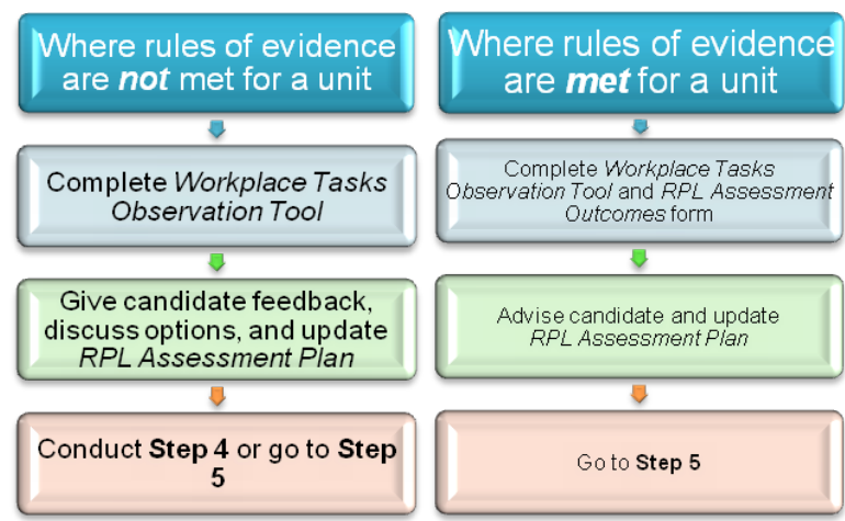
STEP 4: THIRD PARTY REPORTING

For each workplace task observed, assessors should record the process and the skills and knowledge demonstrated by the candidate in the Workplace Assessment Tasks: Observation Tools including adapting the blank observation tool template for any assessor-devised assessment tasks.